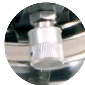
Stainless Steel Gr. 316 Flow Control System