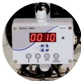
Delay Start & Auto Switch-Off Digital timer