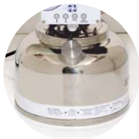
Stainless Steel Gr. 316, Autoclavable, Leak Proof Tank